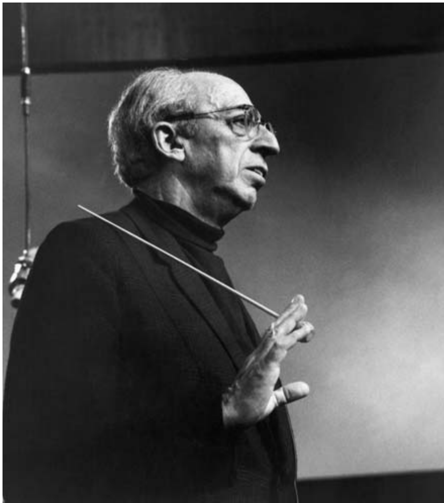
Aaron Copland, elected 1951