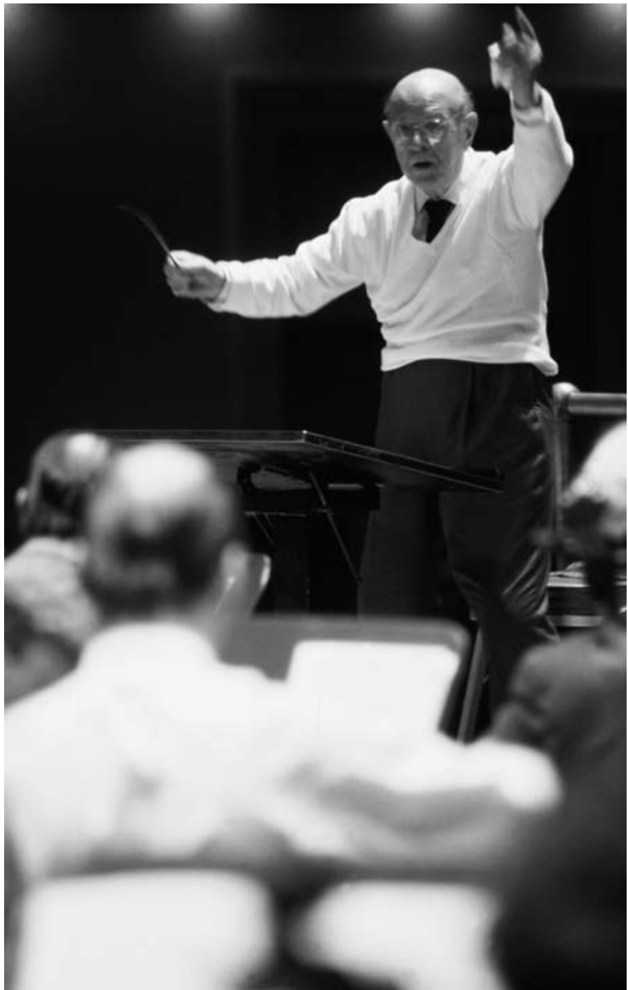
Pablo Casals, elected 1960

Career description : Classicist; Archaeologist; Educator; Academic administrator